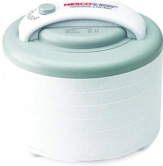
Nesco Snackmaster FD 75-A